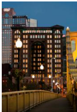
The Renaissance Pittsburgh Hotel and Braddock's American Brasserie will be serving Thanksgiving dinner.

All of the leftovers from the meal will be packaged and sent home with the family to make those delicious turkey sandwiches for days to come. Dishes and cleanup will be done by the staff and the family can enjoy the rest of the evening together in Pittsburgh.